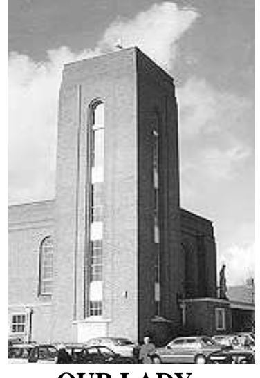
OUR LADY, QUEEN OF APOSTLES